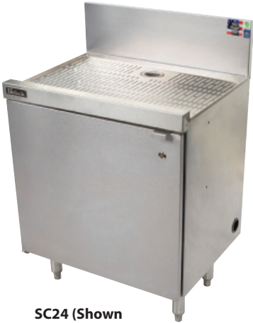
SC24 (Shown with Door)