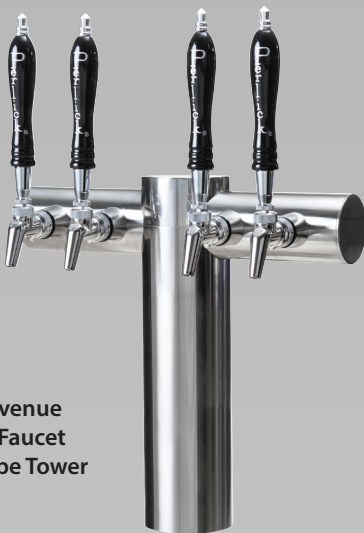
Avenue 4 Faucet T-Pipe Tower

The simple, clean lines of our Avenue Towers offer a design that easily adapts to any space. Pure copper coolant lines and cold block maintain chilled beverage temperature. And as with all Perlick towers, our insulated dispensing heads ensure a perfect temperature right up to the faucet.