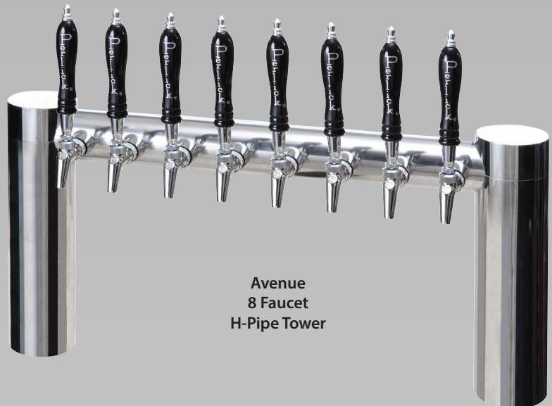
Avenue 8 Faucet H-Pipe Tower