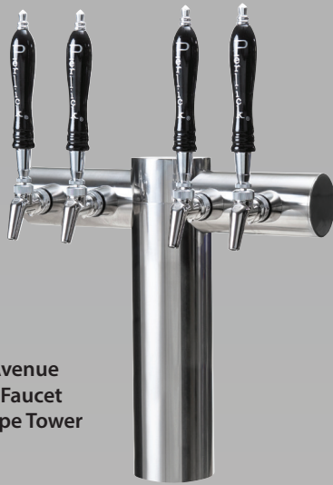
Avenue 4 Faucet T-Pipe Tower