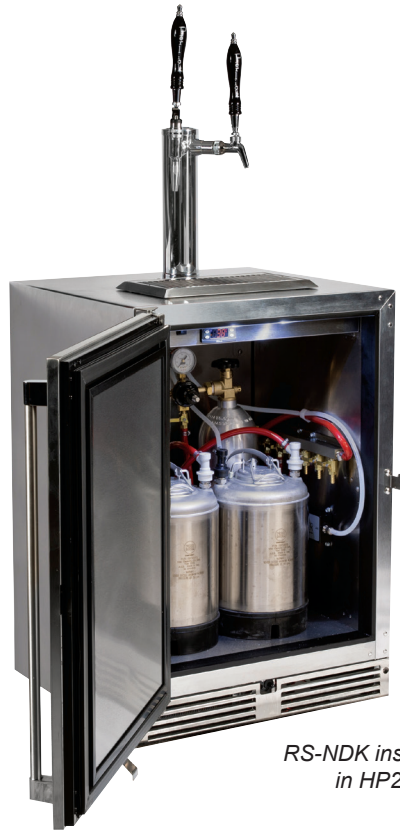
RS-NDK installed in HP24 unit